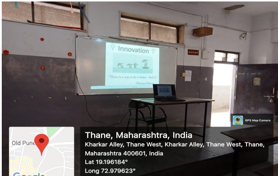
ICT Enabled Classroom